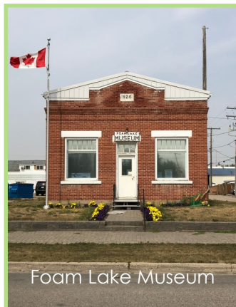
Foam Lake Museum