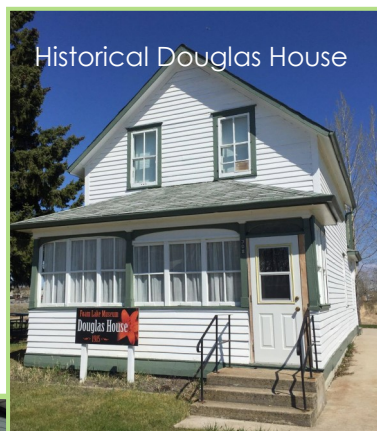
Historical Douglas House

Come into the Foam Lake Visitor Centre 8:00am to 8:00pm each day May through September, where our friendly staff can answer any questions you may have about Foam Lake and its many attractions!