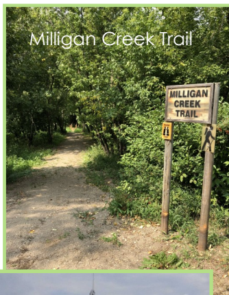
Milligan Creek Trail