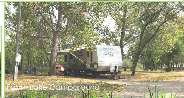
Foam Lake Campground