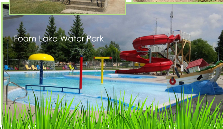
Foam Lake Water Park