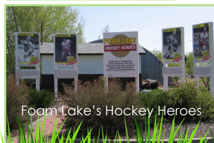
Foam Lake's Hockey Heroes