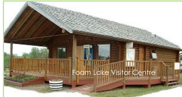
Foam Lake Visitor Centre